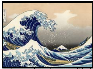
Hokusai and Hiroshige Woodblock Demo & Art Lesson

Japanese Dance Fresh Japanese Food Fun Crafts & Games