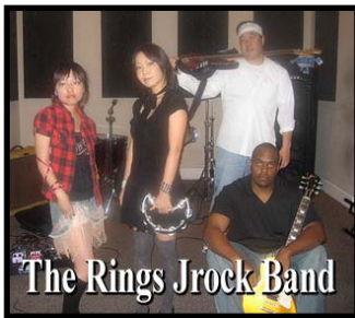
The Rings Jrock Band

www.TemeculaSisterCityAssociation.org FREE ADMISSION (951)750-1088